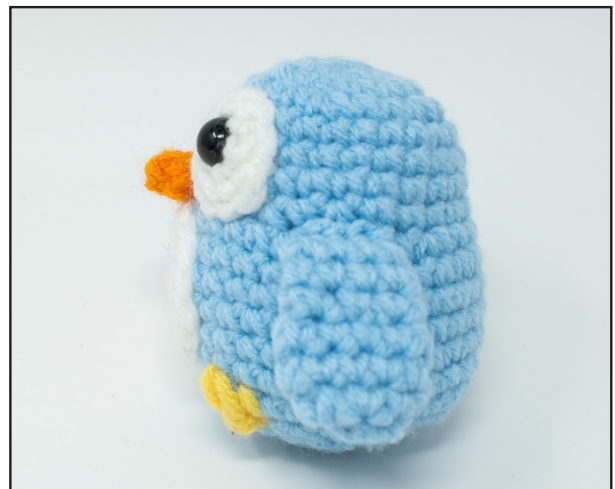
Figure 15: Wing placement