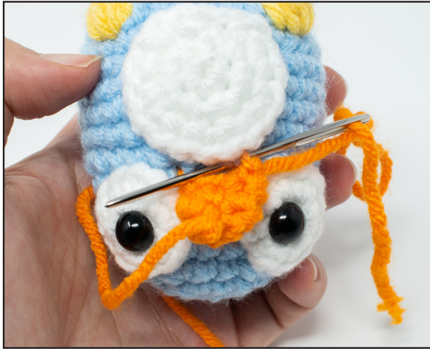
Figure 12: Sewing on the beak

Step 3: Sew the beak onto the face, between the eyes and just above the belly.