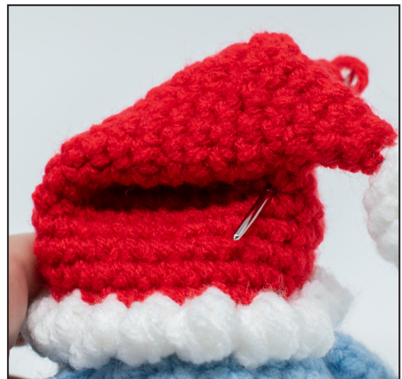
Figure 19: Sewing the hat fold