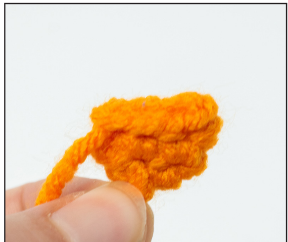
Figure 6: Completed beak