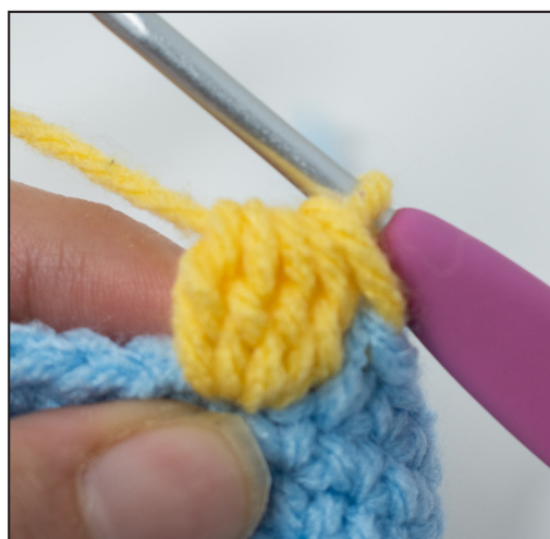
Figure 2: Round 15 - One completed foot/Bobble Stitch