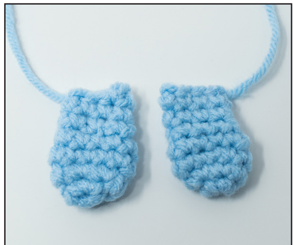
Figure 7: Completed wings