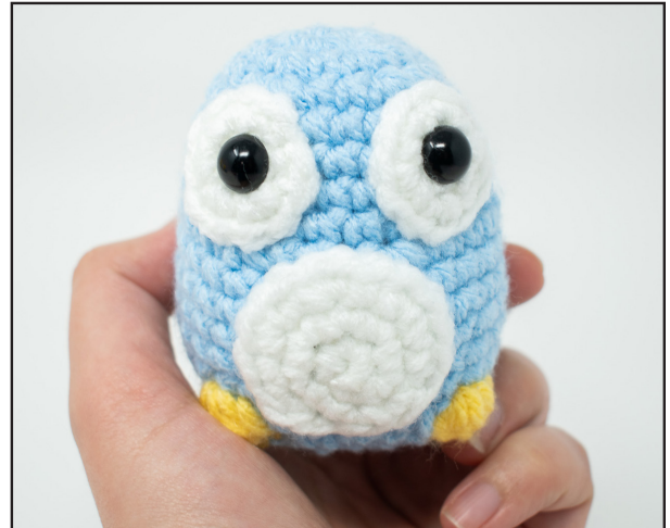
Figure 9: Placement of eyes

Step 2: Sew the eyes to the body, just above the belly and with about 2 stitches between the widest part of the eyes. The stalk of the safety eye should go between Rounds 6 and 7.