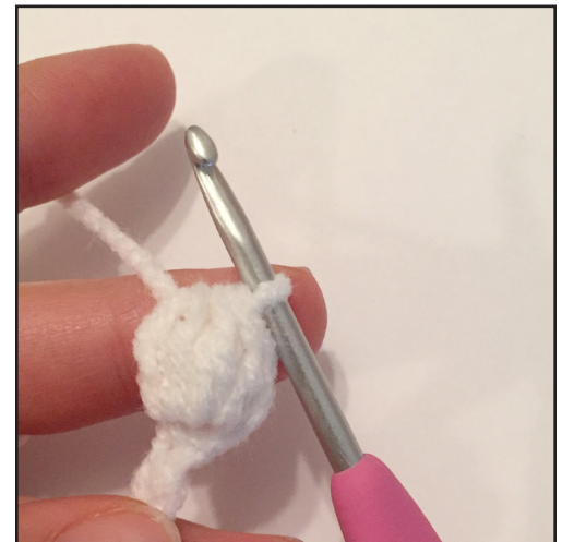
Bobble Stitch Step 5

Yarn over, pull through all 5 loops on your hook. This will complete your first bobble!