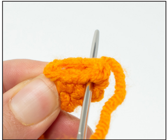
Figure 5: Sew the beak flat

Finish off, leaving a long end. Do not stuff. Instead, press the sides of the top edges together to flatten the wing and then sew straight across the opening to close it up.