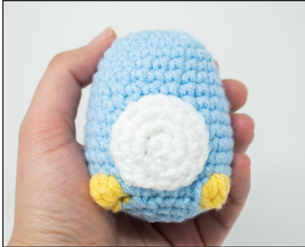
Figure 8: Placement of belly

Step 1: Sew the belly to the body between the feet. The top of the belly should be at Round 8, and the bottom should be at Round 14.