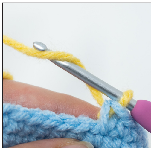
Figure 1: Round 15 - change colours to yellow prior to making your Bobble Stitch

Finish off and close up the hole. Weave in all ends.