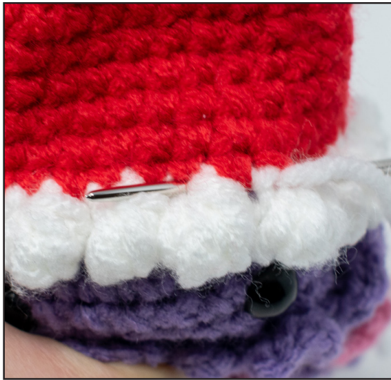
Figure 16: Sewing the hat on (picture is from my jellyfish pattern, but same idea)

Finally, thread a length of red yarn or red ribbon through the top of the hat and tie it into a knot (or a nice bow!). Then this cute little penguin can hang out on your Christmas tree!