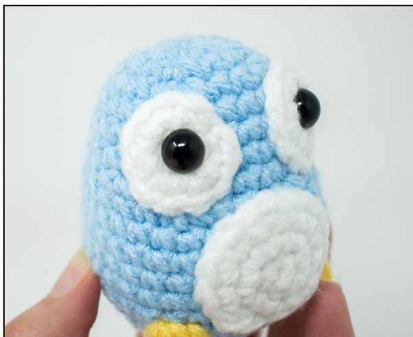
Figure 10: Placement of eyes