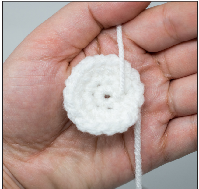
Figure 3: Completed belly