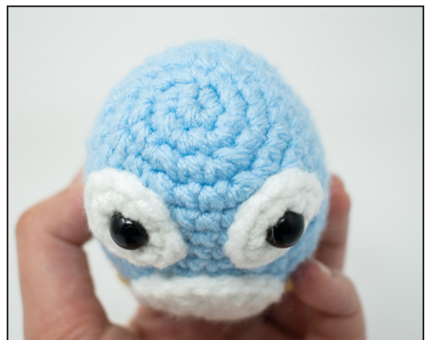
Figure 11: Placement of eyes