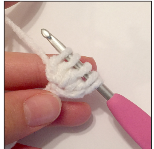
Bobble Stitch Step 4

Repeat step 3 two more times until you have five loops on your hook.