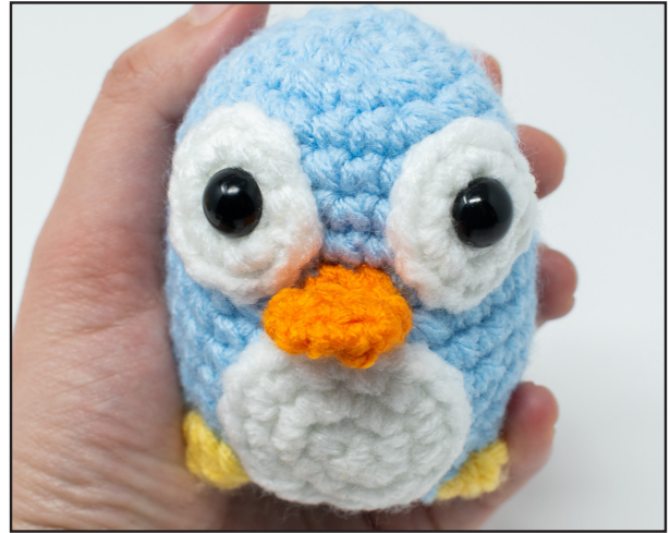
Figure 13: Beak placement

Step 4: Sew the wings to the sides of the body. The top of the wings should be level with Round 8, and they should be equally placed on either side of the body.