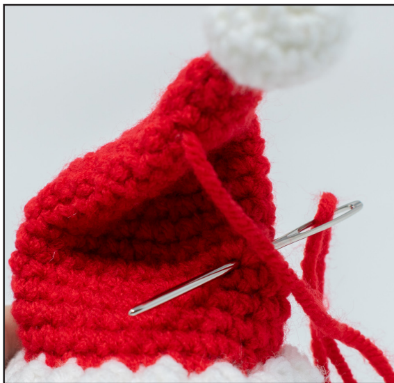
Figure 18: Sewing the hat fold