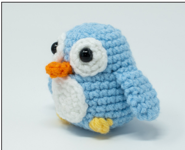
Figure 14: Wing placement

Step 4: Sew the wings to the sides of the body. The top of the wings should be level with Round 8, and they should be equally placed on either side of the body.