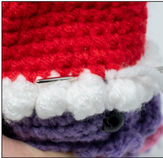
Figure 11: Sewing the hat on

Finally, thread a length of red yarn or red ribbon through the top of the hat and tie it into a knot (or a nice bow!). Then this cute little jellyfish can hang out on your Christmas tree!