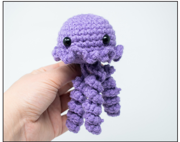
Figure 8: Large tentacles sewn on