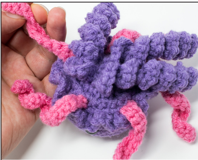
Figure 9: Sewing the small tentacles to the head