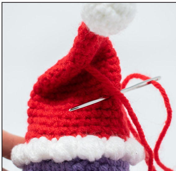
Figure 13: Sewing the hat fold