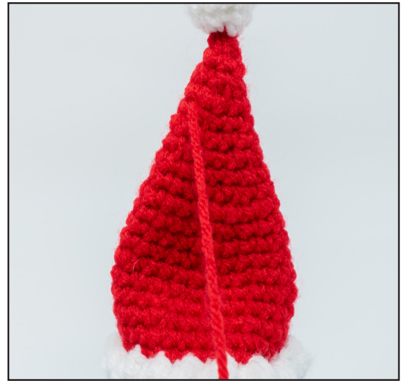
Figure 12: Weave the red end down so it is placed a few rounds below the top