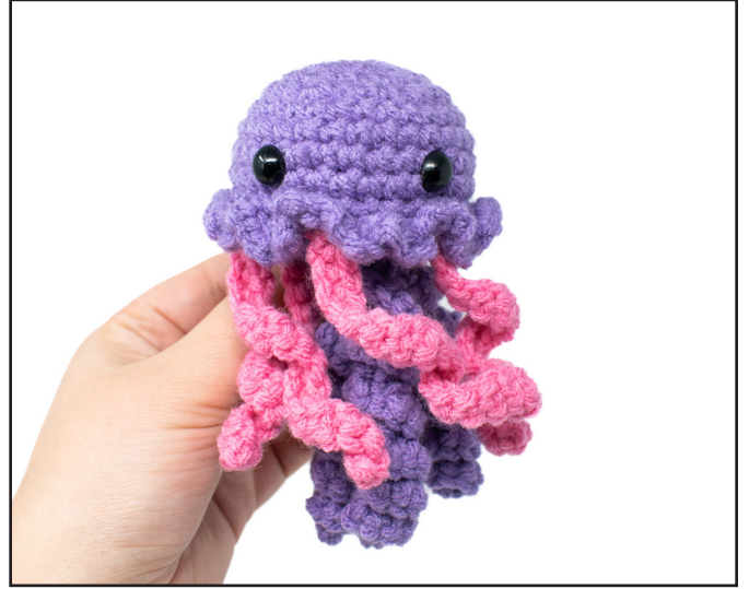
Figure 10: Completed jellyfish