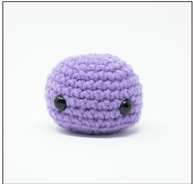
Figure 1: Head

Finish off and close up the hole. Weave in all ends.