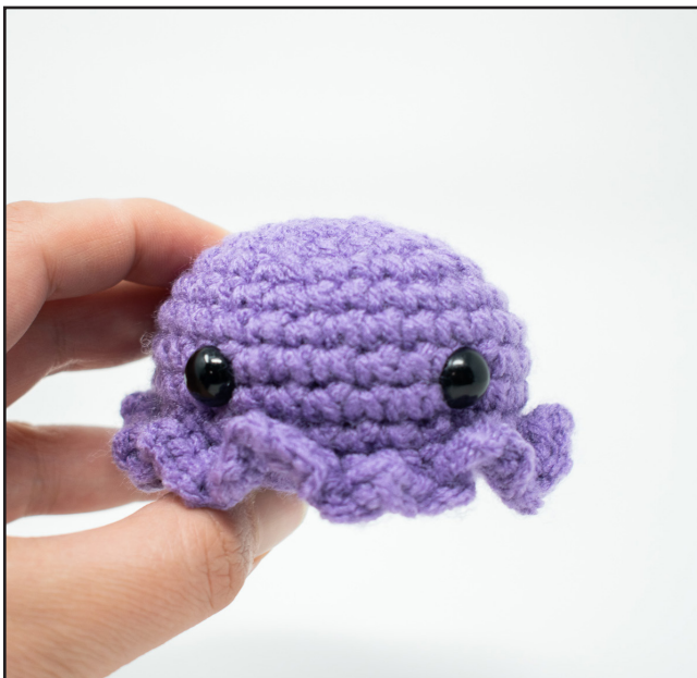
Figure 3: Completed head