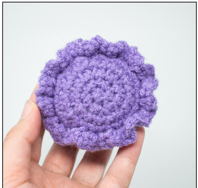
Figure 4: Underside of completed head