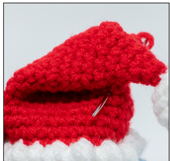
Figure 14: Sewing the hat fold