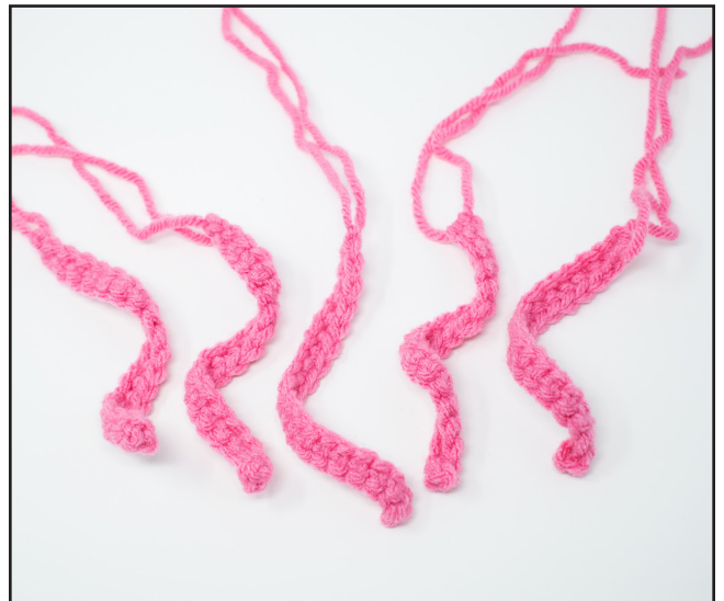
Figure 6: Completed small tentacles