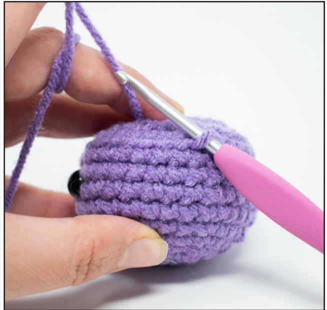
Figure 2: Attach the yarn for the fringe.

Fringe: Starting in the same stitch where you attached your yarn - (Sc 1, Ch 1, Sc 1) into each stitch around. At the end, Slip stitch into the first Sc to join, finish off, and weave in all ends.