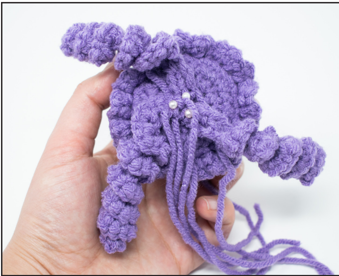
Figure 7: Pinning the large tentacles to the head

Read on if you'd like to make your jellyfish into a Christmas ornament, otherwise you're done!