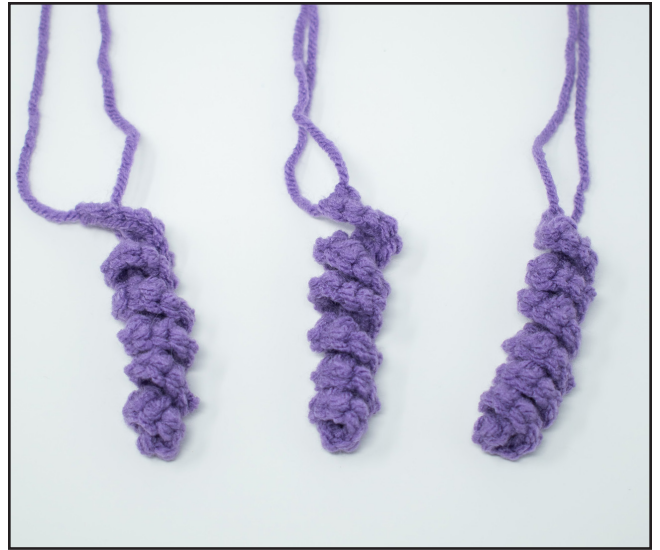
Figure 5: Completed large tentacles