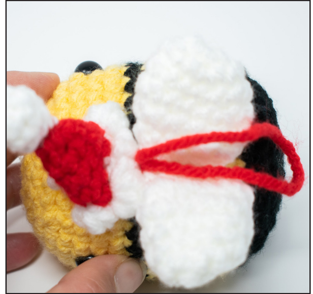
Figure 7: Ornament hanger