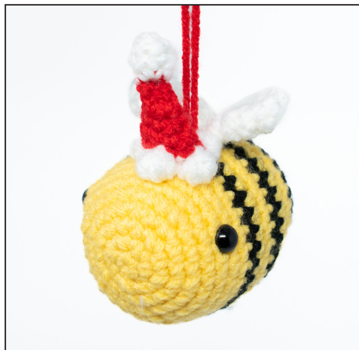
Figure 8: Completed bee with Santa hat