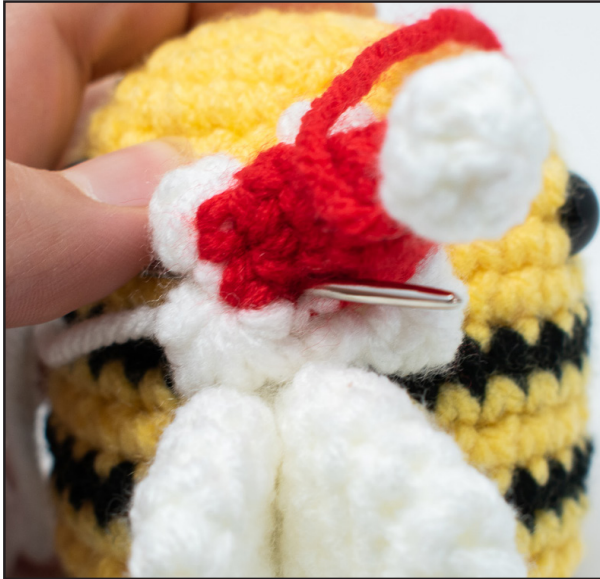
Figure 6: Sewing the hat on

Finally, thread a length of red yarn or red ribbon through the top of the bee, between the wings and the hat, and tie it into a knot (or a nice bow!). Then this cute little bee can hang out on your Christmas tree!