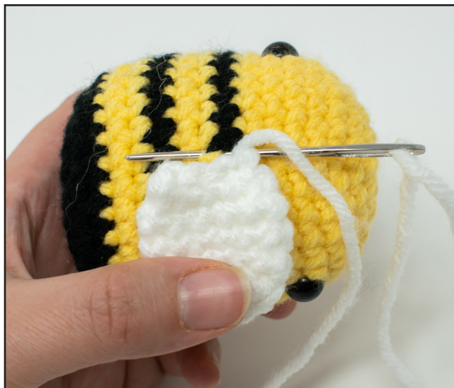
Figure 4: Sewing on a wing