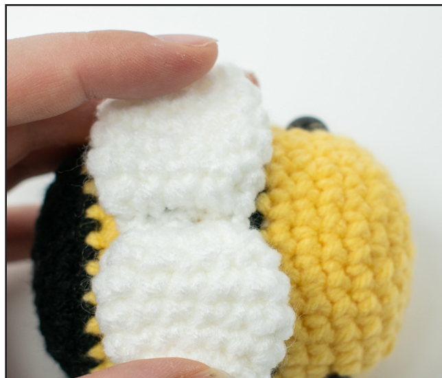
Figure 5: Wings sewn on