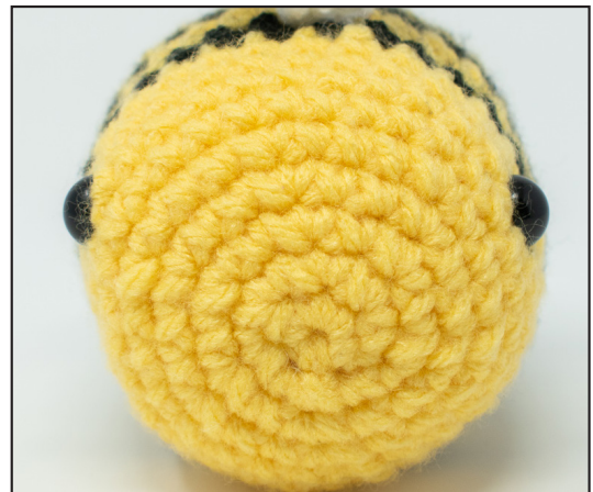
Figure 1: Eye placement

Finish off and close up the hole. Weave in all ends.