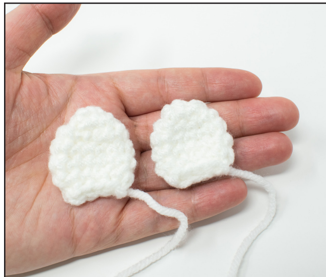
Figure 3: Completed wings

Sew the wings directly next to each other at the top-middle of the bee, making sure they are centered between the eyes ( Figures 4-5 ). If you are adding a Santa hat, then sew the wings a bit further back to make room for the hat.