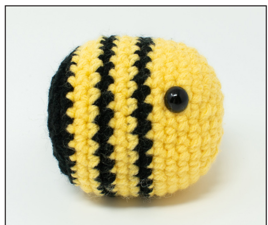
Figure 2: Finished body