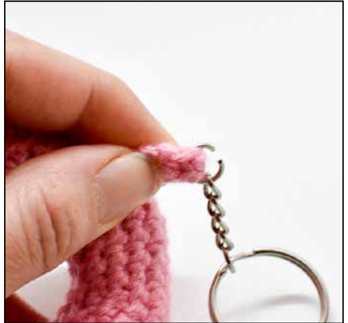
Figure 13: Attach the jump ring to the chain and the loop