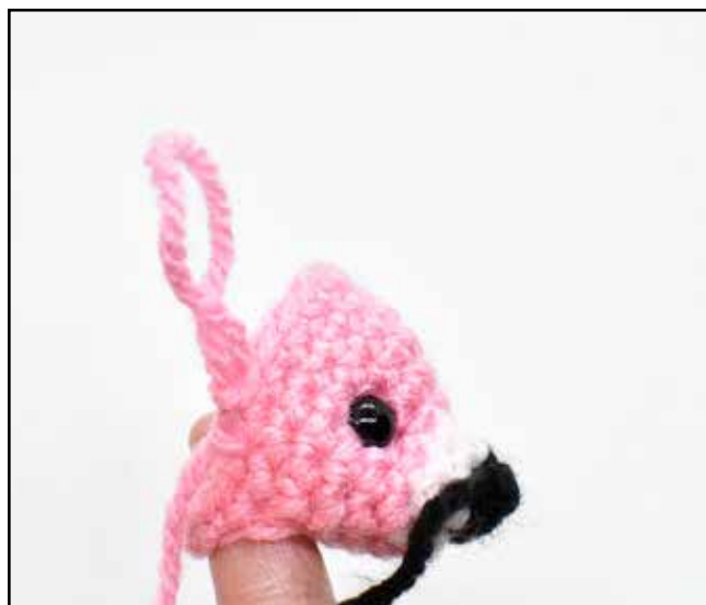
Figure 7: Eye placement