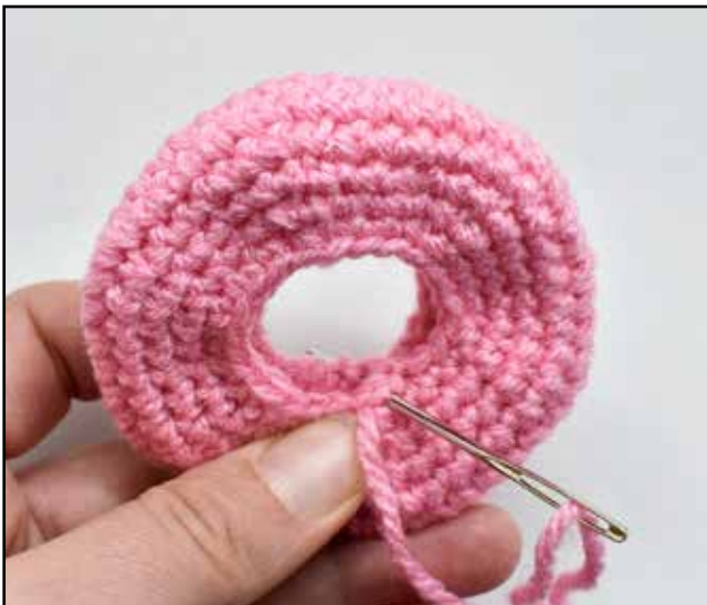
Figure 1: Flatten the donut and sew together around the middle hole, stuffing as you go

Stuff the donut ring firmly as you go – don't leave the stuffing for the end, it will be too hard to get the stuffing in!