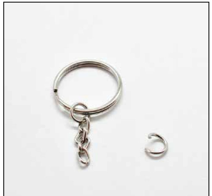
Figure 11: Keychain