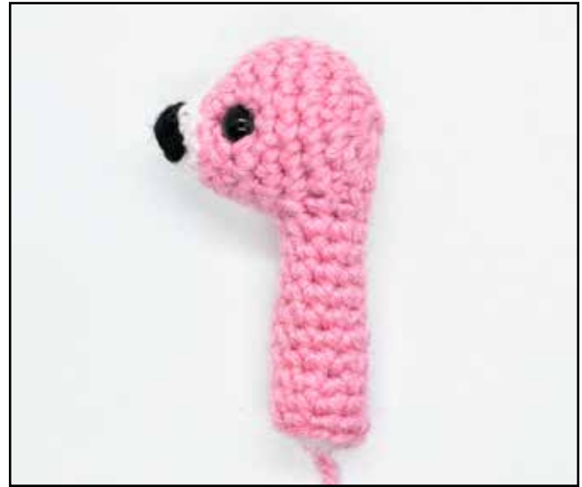
Figure 3: Completed head and neck

Finish off and close up the hole. You can start stuffing the head through the neck hole now, and continue to add more as you make the neck.