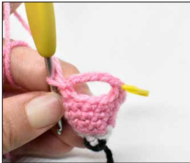
Figure 5: Row 9 - Skip 3 stitches then continue around the head