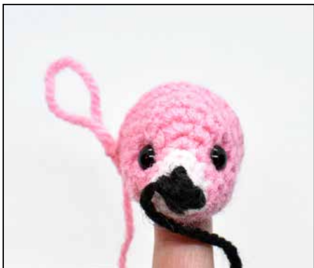
Figure 6: Eye placement