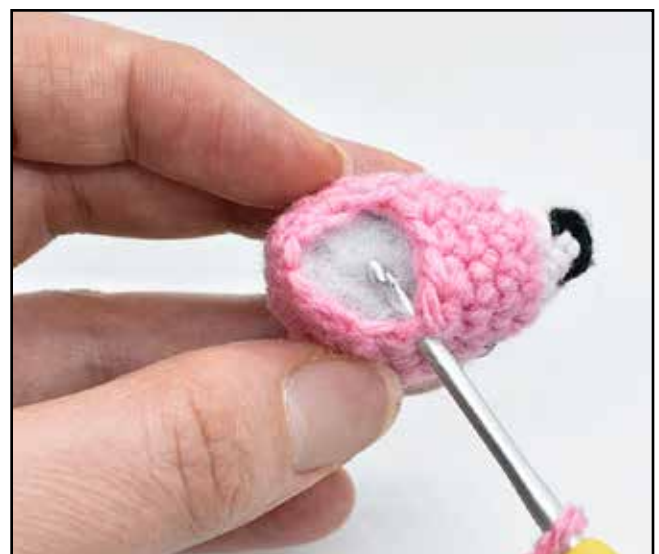
Figure 9: Insert hook into the corner before the chains and work clockwise from here.