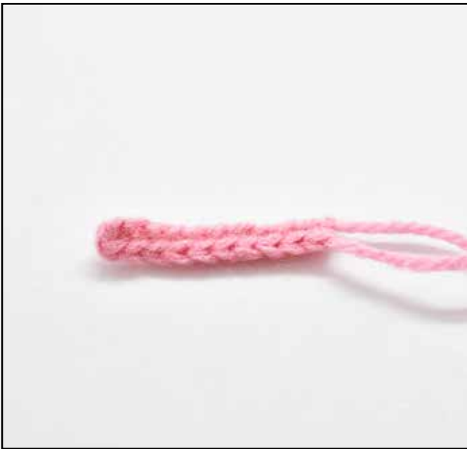
Figure 10: Creating the loop

If you have a keychain where the jump ring is already closed and can't be easily opened, then skip to my instructions for attaching a closed jump ring to your flamingo.