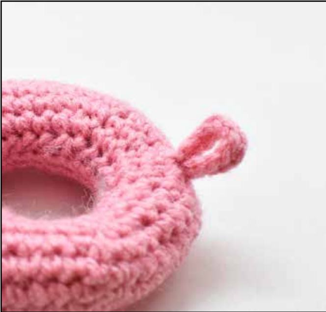
Figure 12: Loop sewn to the donut ring

Join the yarn into a loop and stitch it securely to the flamingo. (Figure 12) To attach the keychain, insert the open jump ring through the chain of the keychain and then through the yarn loop you just made. (Figure 13) Use pliers to close the jump ring tightly.