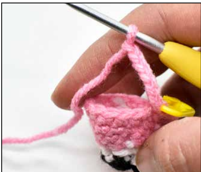
Figure 4: Row 9 - Chaining 6 to make the neck hole