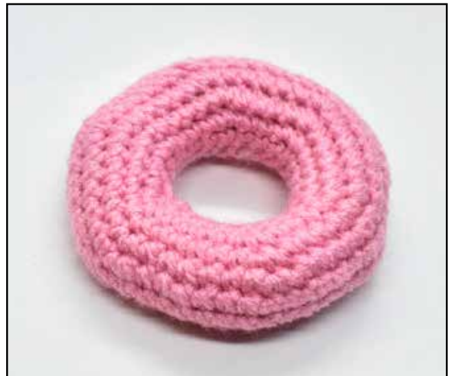
Figure 2: Completed donut ring